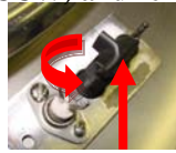
Pilot Hood- turn CCW.