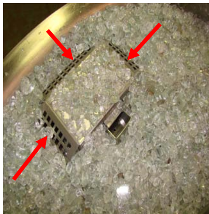
DO NOT COVER VENTS!

Blowout Box: Do not cover blowout box vents or opening with lava rock or glass- this must remain open. This will cause the pilot flame to suffocate and turn off pit.