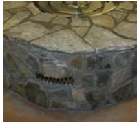
Vents- 2 Total