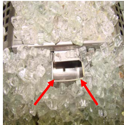
DO NOT COVER PILOT OPENING!